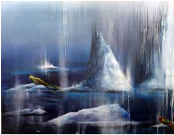
Caroline List: 'Unnatural Selection' - Oil on canvas- 100cm x 90cm