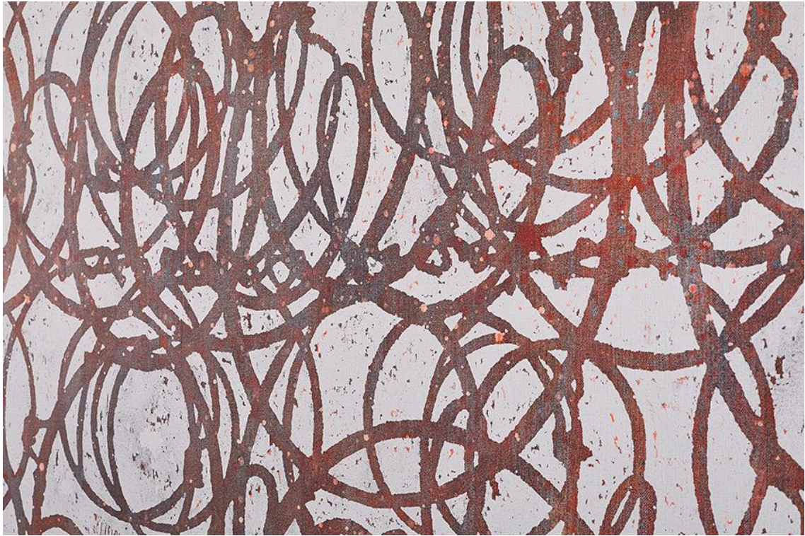
Adam Ball, Aftermath , 2018 (Detail)

Encounter Contemporary presents Remnants and Realisation , a major exhibition by leading contemporary British artist Adam Ball (1977). Opening on the 17th September, Remnants and Realisation has been chosen as the first exhibition to be held in the newly developed 4,600 sq. ft gallery of the recently refurbished Grade II listed Smithson building (formerly known as the Economist building). Situated in the heart of St James's contemporary art district, the exhibition will run until the 8th October to coincide with Frieze London and London Design Festival.