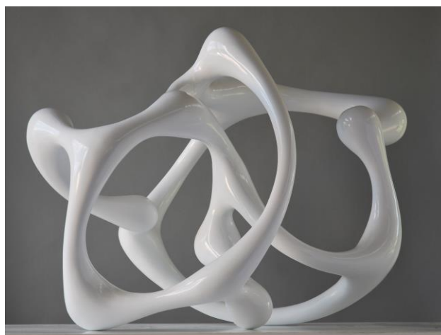
Oliver Barratt, After Matisse , 2014, Steel, Resin, Fibreglass, Paint 90 x 62 x 70 cm