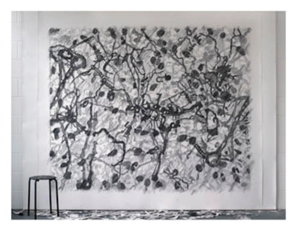
Fearless, Charcoal on hand-cut paper, 222 x 266 cm