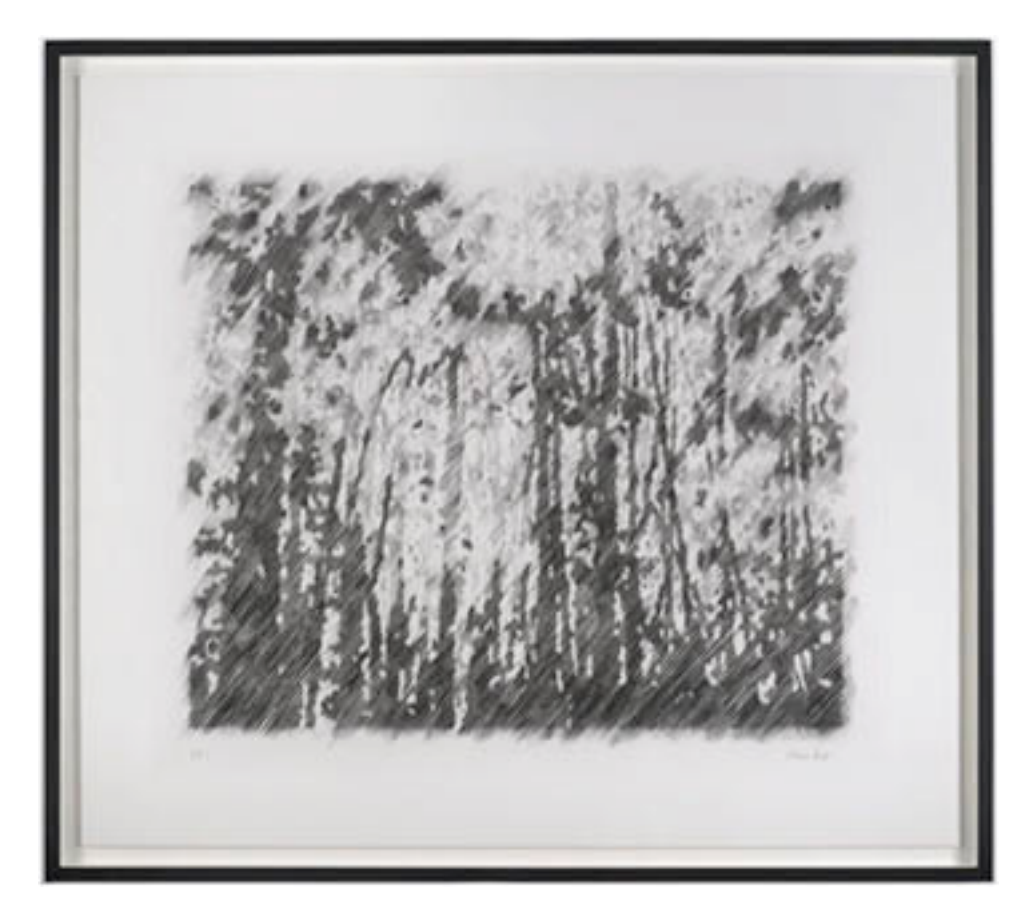
The Living Other, Photopolymer gravure etching, 96 x 109 cm